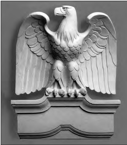
Sculpture - 10727 H. 18" W. 16" P. 5 1/2"

Cartouche: an ornamental tablet often inscribed or decorated; framed with elaborate scroll-like carving.